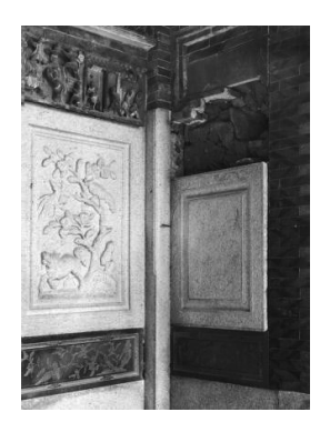
Figure 2. The Brick Carvings of DeDian House was Stolen.

This passive protect model brings more disadvantages. People's awareness of protection is very weak. After the Tsai's Ancient Folk Houses had become "Key Cultural Relics Site Under the State Protection", DeDian house in the dwelling was stolen, the brick carvings on both sides of the doorways were taken away(figure 2). On the one hand, the house is no longer inhabited; on the other hand, the administration office and the security team are only responsible for daily protection and management, lacking the attention and maintenance of local residents at the forefront.