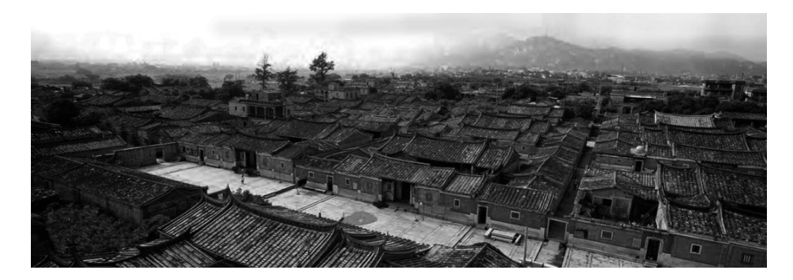
Figure 3. "Feng shui" Pattern of Facing Water and Back Mountain.

Nearly two decades after it was listed as "Key Cultural Relics Site Under the State Protection", its tourism development is limited to selling tickets. And, the ticket sales were not strictly enforced because of the number of residents living in the area and the roads linking it to surrounding villages. Furthermore, there is no sign system for the ancient dwellings, no public transportation system to reach it, and nearby hotels and restaurants are relatively rare. The Tsai's Ancient Folk Houses are like a shy girl hiding in a boudoir. Through interviewing local heritage protection bureau we learned: in addition to the fear of the shortcomings of tourism development, Tsai's Ancient Folk Houses development has its particularity, the dwellings of the ownership issue hasn't been solved yet, because Tsai's ancestor is overseas Chinese, their many descendant also development in southeast Asia, after several generations of breeding and expanding, each building houses ownership may not less than 10, and spread around the world, it is difficult to discuss effective residential development work.